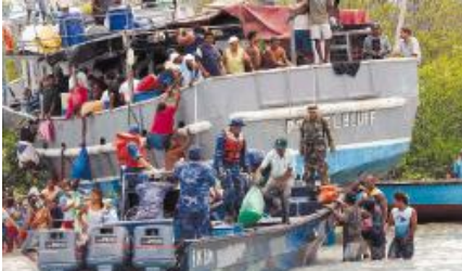
Navy boats searching for survivors

The devastation of the hurricane has been much greater than was initially thought. The hurricane has wiped out entire communities without a single home remaining in these communities. Many schools, churches and health clinics have also been destroyed throughout the area. Many of the more remote rural areas have been completely isolated by the rains with little access to food, water, shelter or medicines. There are cadavers floating in the water that continue to be picked up by the military helicopters helping in the search and rescue efforts. Many of those who died in the hurricane were women because they did not know how to swim. Most of the men swim because they are